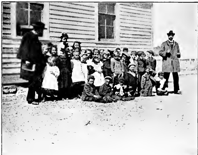
INFANTS' SCHOOL, FORT AMITY.